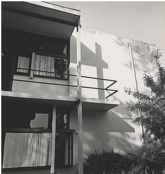
FIG. 1.2 Damage to the house became increasingly visible