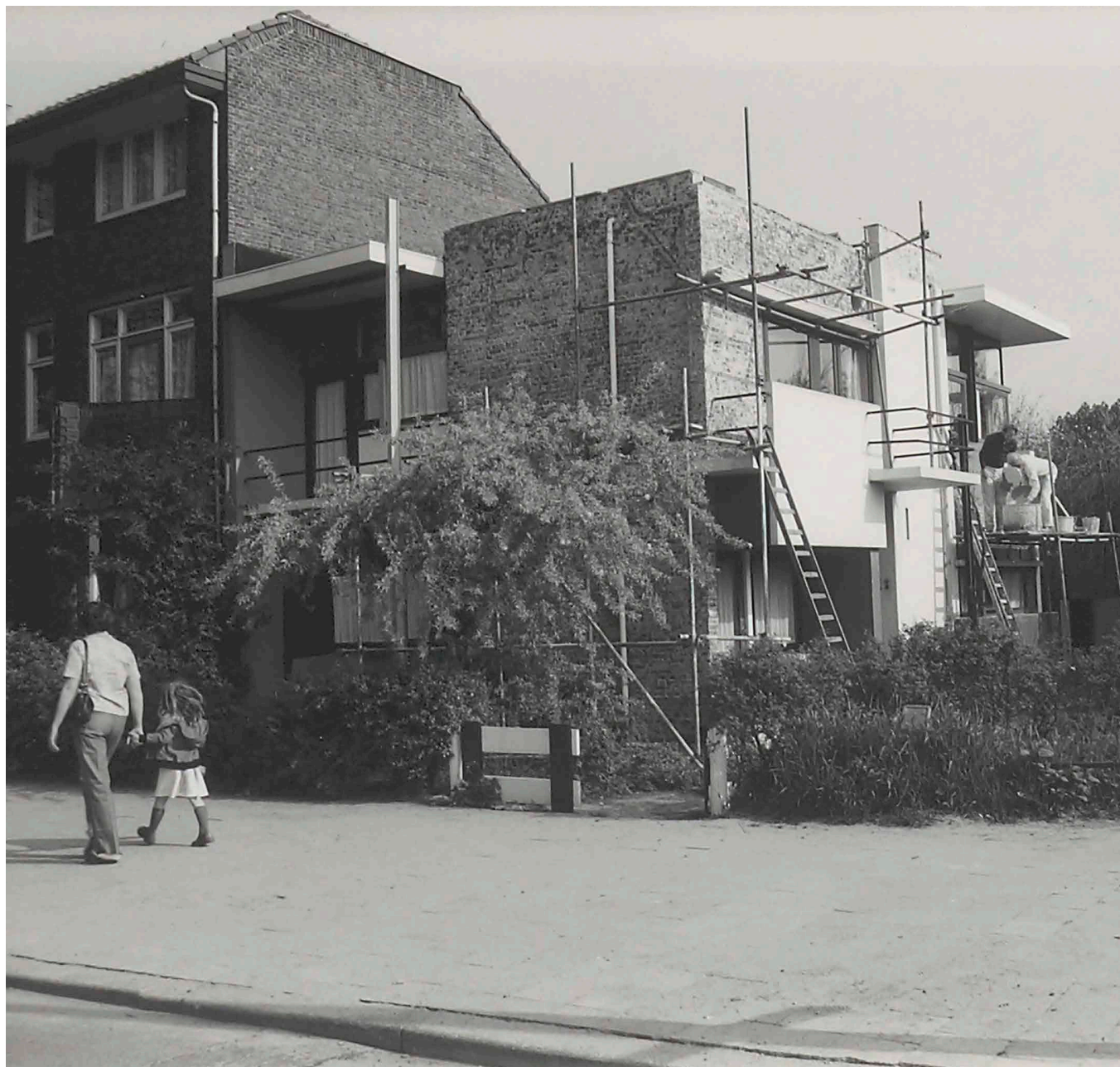
FIG. 1.12 South elevation (Prins Hendriklaan) with bare brickwork