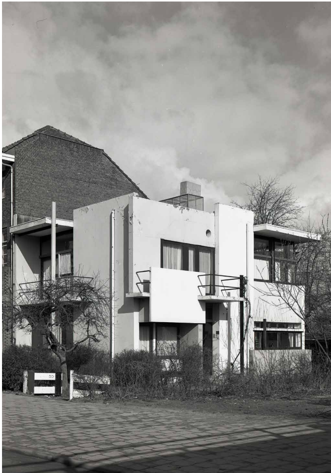
FIG. 1.1 In the beginning of the 1970s the state of repair of the Schröder House left a lot to be desired