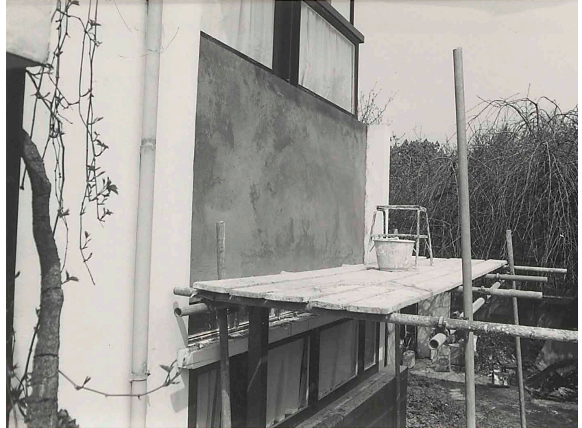
FIG. 1.11 After the plaster with hairline cracks was removed, the new render was applied in a single homogeneous coat

All kinds of repairs had been carried out, and the house was also a melange of different materials and constructions. It was consequently decided that it would be best to limit the number of materials and adhesive surfaces as much as possible. The new coat would be applied in one operation. 38