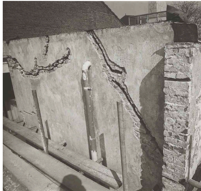
FIG. 1.9 The brickwork displayed deep cracks

In spring 1975 the paintwork, on both the restored and unrestored wall sections, displayed small cracks. 31 Tapping on the three restored walls revealed that the final coat of render had not bonded with the substrate. The coat of paint had also failed to adhere in several places resulting in a patchy appearance. In October 1975 these problems were inspected on site by Van Zanen, Geerken and Mulder, together with the contractor, plasterer and painter. 32 It was decided to repair the paintwork. The plasterwork was more problematical. When a section of wall was broken open it was found that although the final coat of render had not bonded with the base coat, the base coat itself was not the cause of the problems. The poor adhesion could not be explained by the addition of the synthetic dispersion, but further analysis of the composition would be very costly. It was decided to remove the loose pieces of plaster on two of the three walls and give the final coat of render a supplement of synthetic dispersion. 33 On Geerken's advice, this was not done for the third wall because the cracks there could be 'bridged' in the coat of paint during normal maintenance (every four years). 34