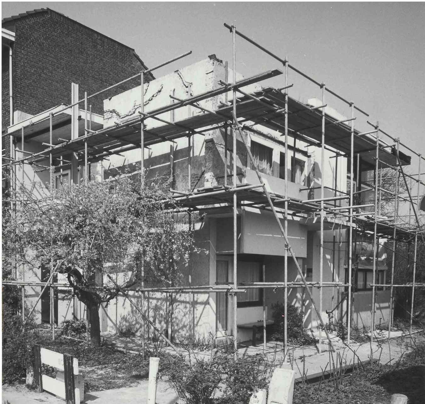
FIG. 1.6 Scaffolded Rietveld Schröder House at the start of the restoration of the exterior, 1974