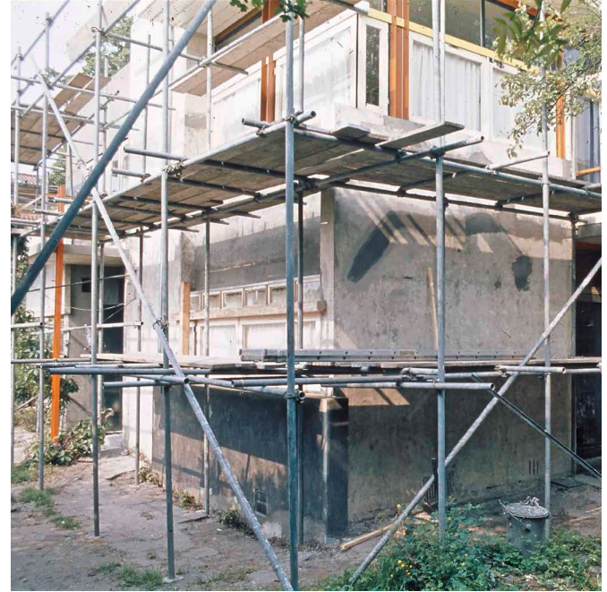
FIG. 1.8 Although the house was surrounded by scaffolding, Truus Schröder continued to live in it during the restoration of the exterior

The roof construction and finishing employed had given rise to sagging, resulting in numerous leaks [FIG. 1.7]. The skylight needed to be replaced. Likewise, much of the timber used in windows and doors, which Rietveld had dictated should be flush with internal and external walls, in other words without sills or projecting edges, was due for replacement. This was especially true of the windows and balcony door in the east elevation, followed by Truus's room. The damage and defects were treated invasively by Mulder, using contemporary materials and techniques, in order '[to] achieve the durability desired by Truus Schröder [FIG. 1.8]. Not through restoration according to traditional standards, but to a large extent through reconstruction of the form using a new, technically superior method.' According to Mulder this was the result of the RDMZ's 'wise decision' to keep the agency's officials well away from the work. 28