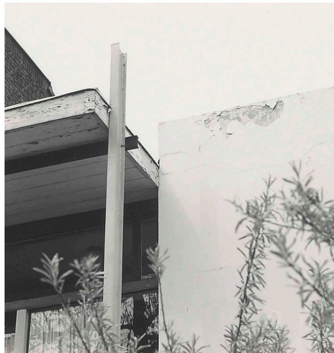
FIG. 1.3 Plasterwork and wood exhibited serious blemishes