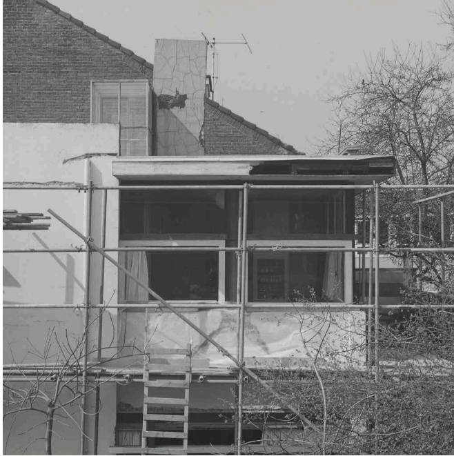
FIG. 1.7 The roof required extensive repairs to prevent further sagging and leaks