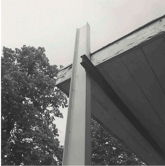
FIG. 1.4 Unconventional constructions made the house vulnerable