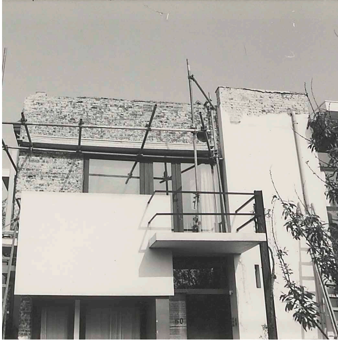
FIG. 1.13 East elevation with the plaster chipped away yet again