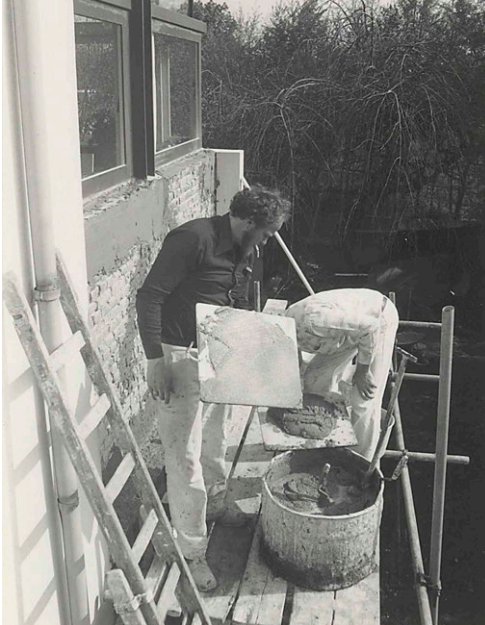
FIG. 1.10 Plasterers at work on the wall between corner window and kitchen