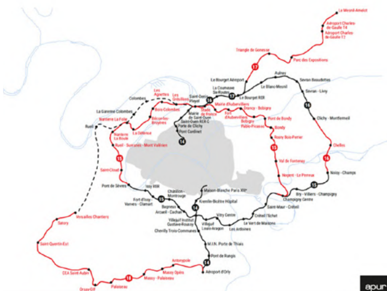
— Gares mises en service entre 2025 et 2030 Source: Calendrier de mise en service de la SGP, cartographie Apur